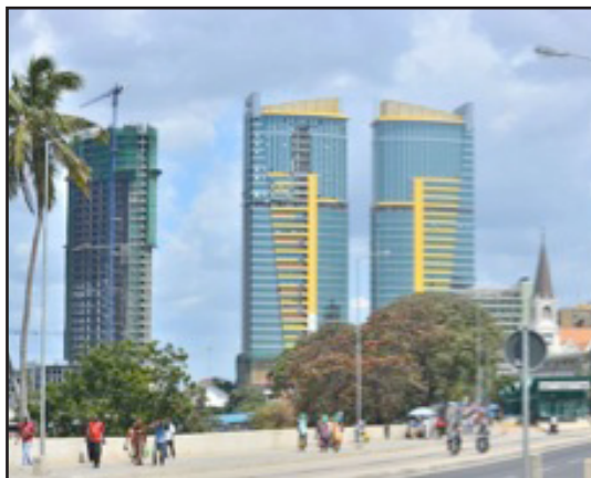
PSPF and Tanzania Ports Authority Buildings, on-going projects in Dar es Salaam, Tanzania

The implementation of public infrastructure relies heavily on the services provided by the private sector (consultants and contractors) in line with the national procurement policy. The majority of public infrastructure projects are executed under the traditional contractual arrangement in which the works are designed by a consultant on behalf of the employer, and works constructed by the contractor procured by the employer. The procurement of public works is governed by the public procurement regulatory framework which has evolved over the last 15 years through a series of Public Procurement Acts (PPA) of 2001, 2004 and the latest one of 2011 using the traditional approach. Occasionally the works are designed by the employer, and supervision may also be carried out by the employer. However, all public works are implemented by a private sector contractor. There have been a handful of public