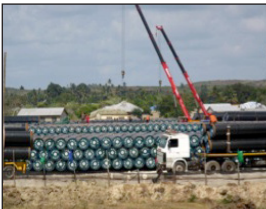
Dar es Salaam Mtwara Natural Gas Pipeline (project value US$1.3 Billion) nears completion.

dard form of dispute resolution associated with the national forms of standard contracts. Individual adjudicators develop and implement procedures, which they consider fair, based on international practice.