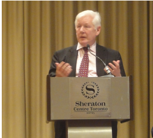
Bob Rae, former Premier of the Ontario Legislature (1978-2013) gives an enthusiastic keynote address.